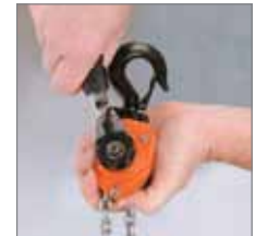
Perform just like larger hoists, but small enough to fit in the palm of your hand.