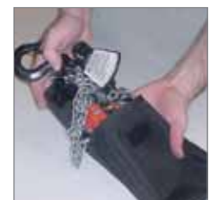
Convenient Carry Bag