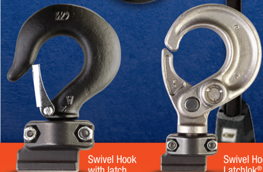
Swivel Hook with latch